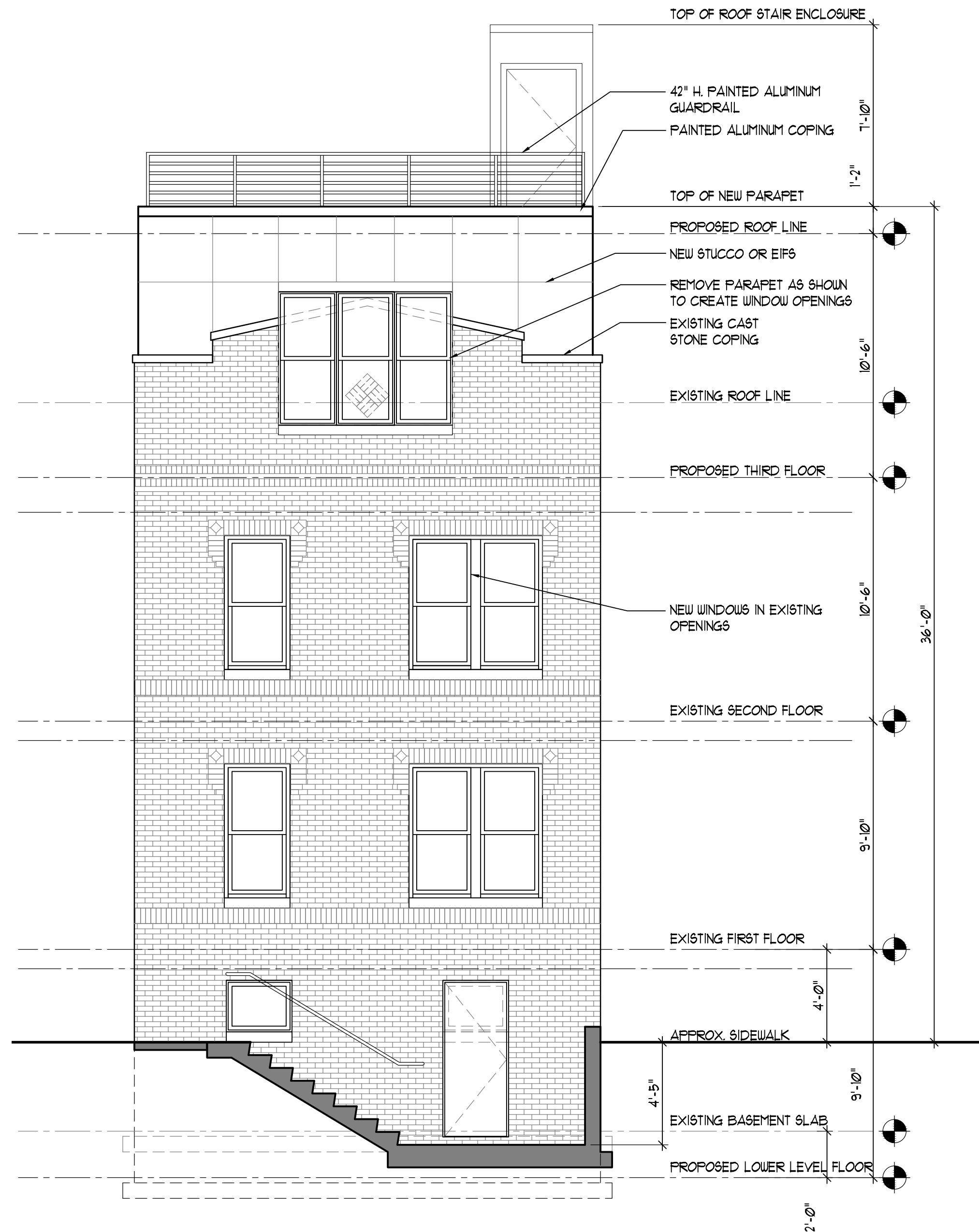
PROPOSED PAVONIA AVENUE ELEVATION