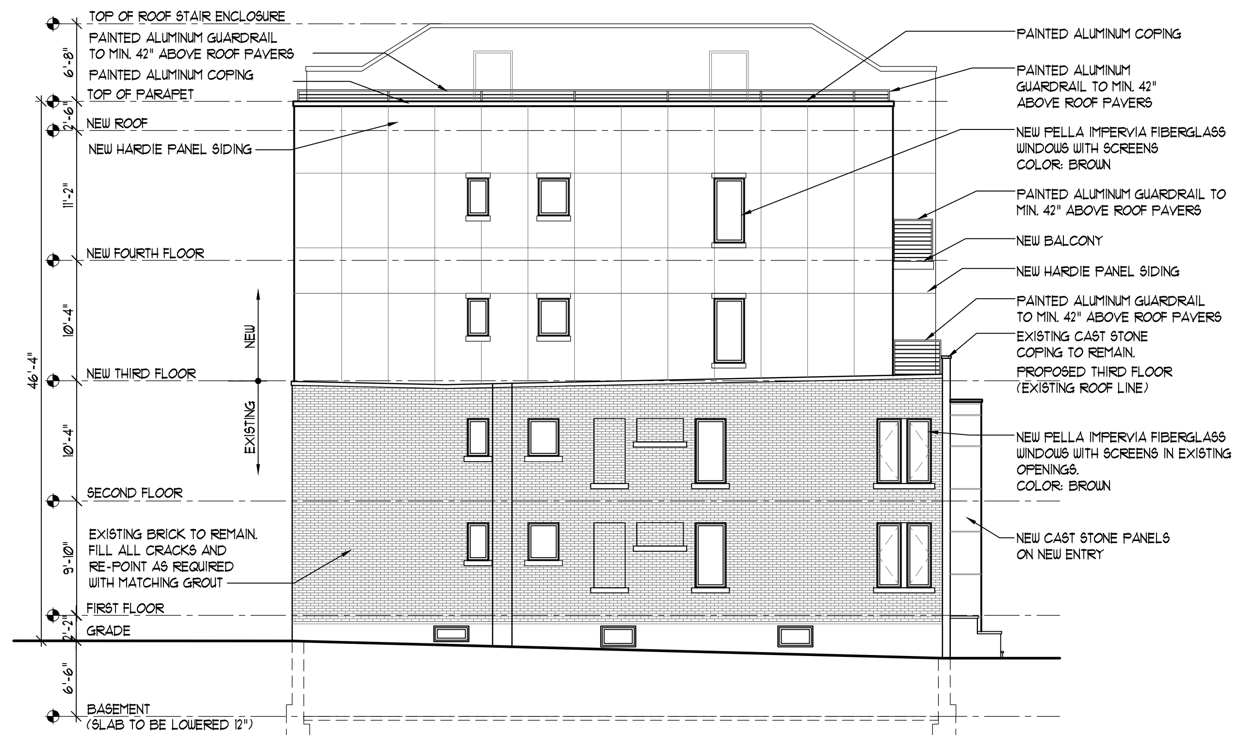
FRONT (SOUTH WEST) ELEVATION