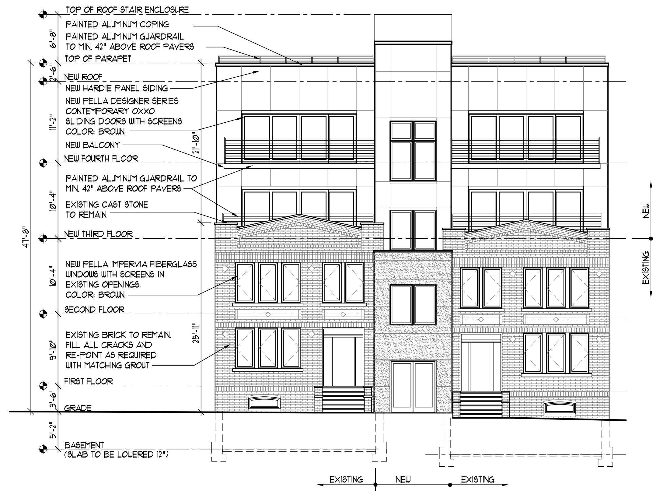
FRONT (SOUTH WEST) ELEVATION